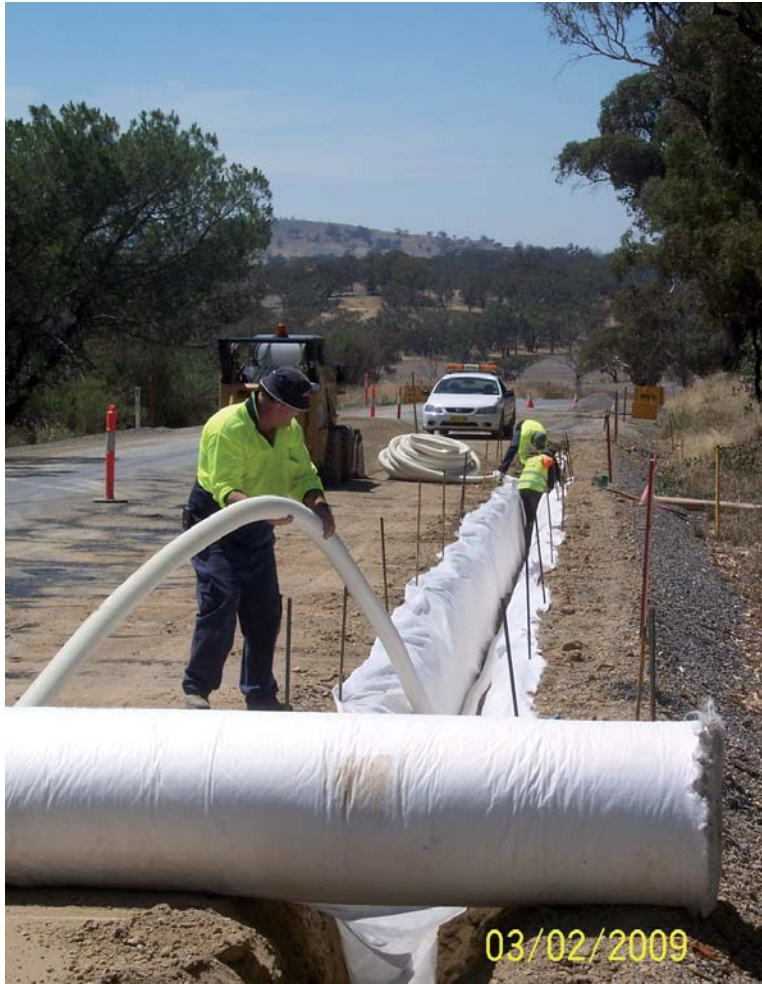
Burley Griffin Way rehabilitation west of Binalong Village (installing subsoil drainage)