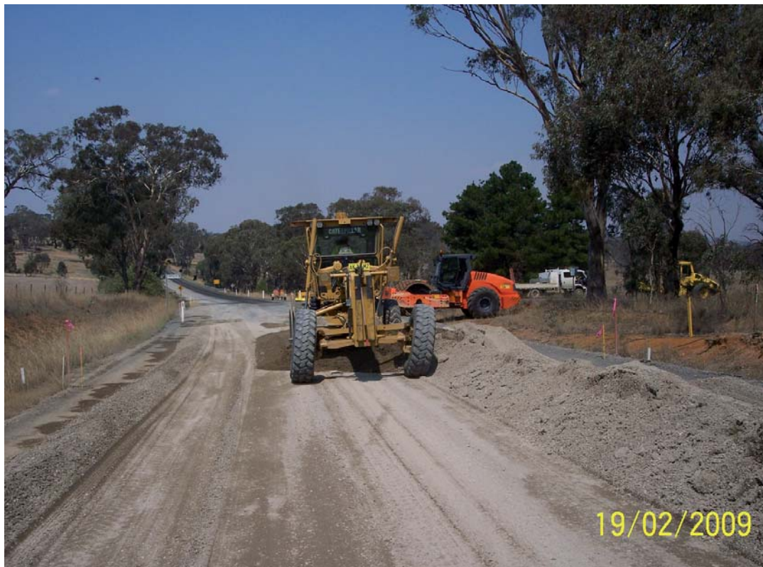
Burley Griffin Way rehabilitation west of Binalong Village